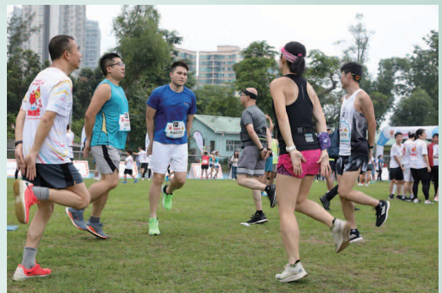
Warm Up Exercise