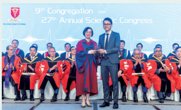
Fellow-in-training Best Abstract Award