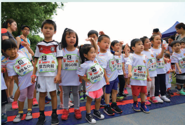
800m family-relay ready to start