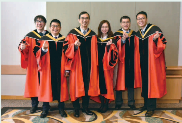
President and newly admitted Fellows