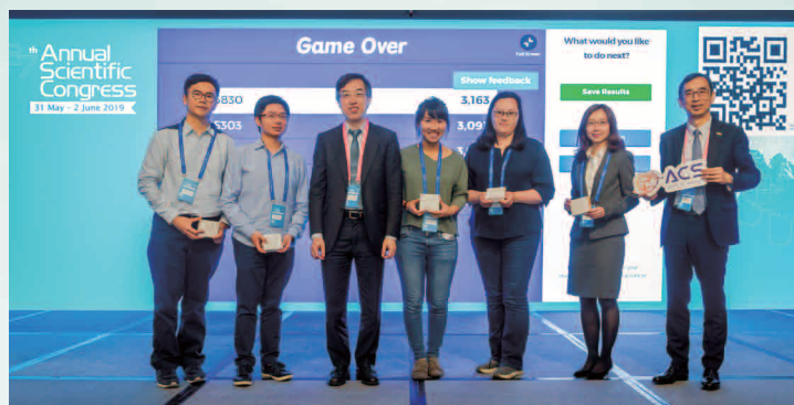
ACS In Action