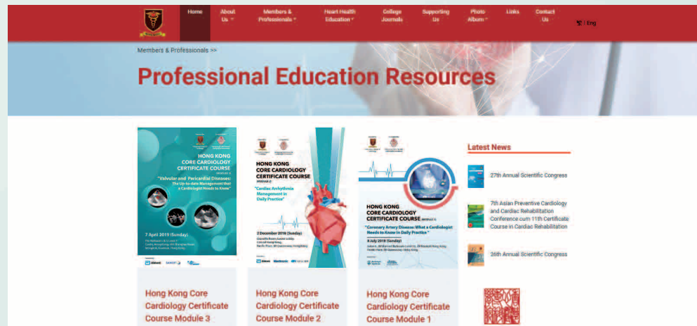
Under the page of Professional Education Resources