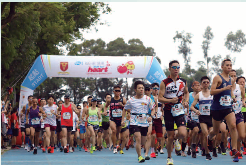
The first race (10km) started