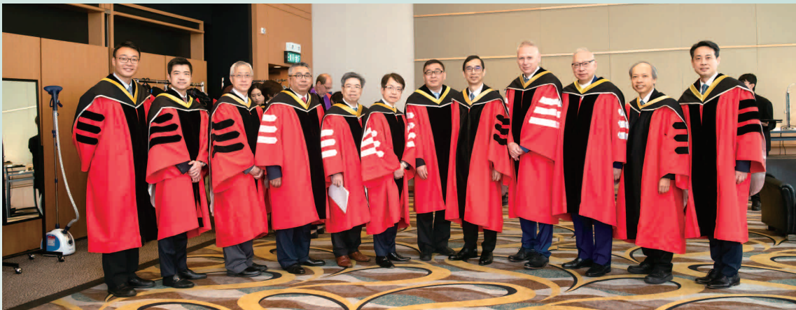
Honorary Fellows, Distinguished Fellows and Council Members