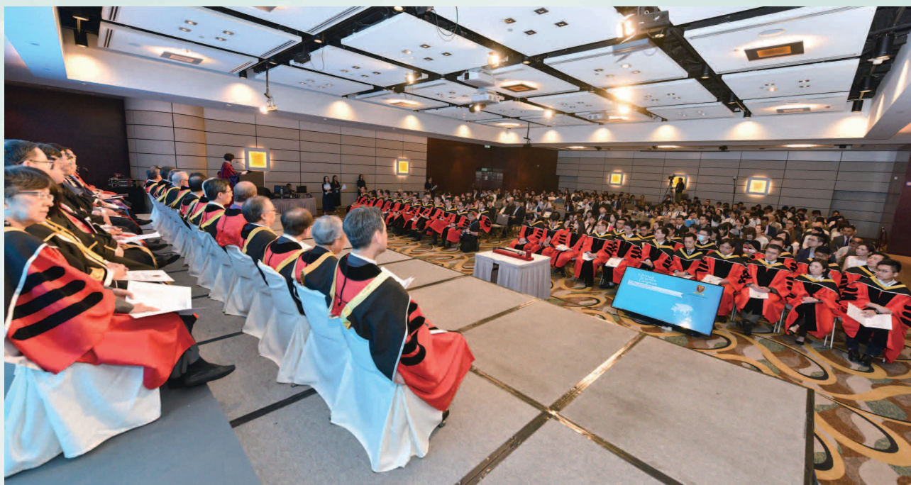
During the ceremony