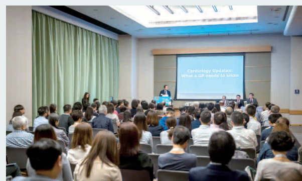
Cardiology Course for General Practitioners